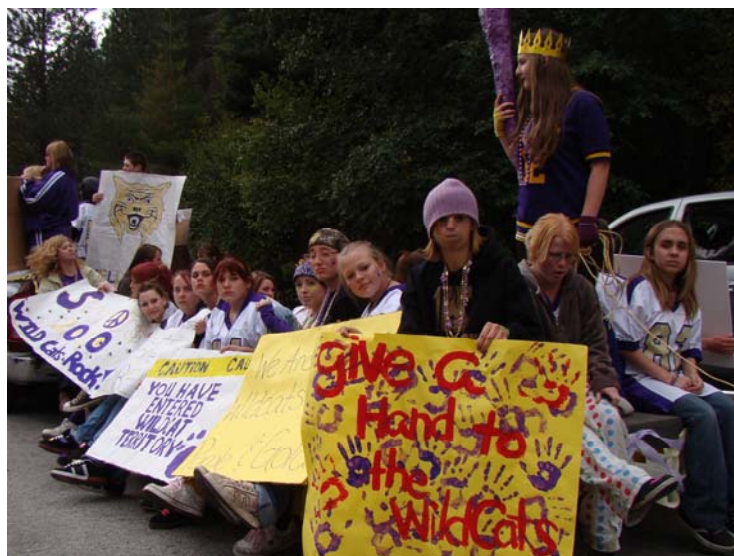
The members of the Spirit Club get ready to leave on a float for the homecoming week parade.