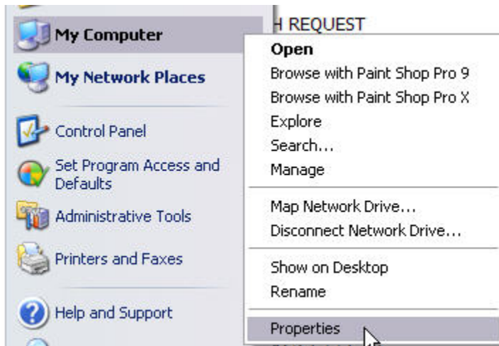
Figure 1: Right-click My Computer, choose Properties